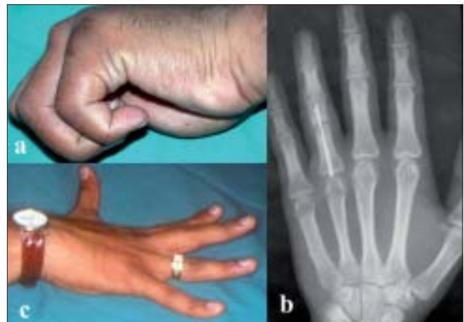
Figure 5: (a) Clinical photograph of adventitious bursitis at the site of entry portal in one patient (b) X-ray depicting of backing of nails causing adventitious bursitis. (c) Clinical photograph of 5° extension lag at proximal interphalangeal joint in one of the patients

Intramedullary nailing of long bones of hand was introduced fairly recently. 6,25 The concept is similar to the flexible nailing technique of Ender and Simon Weidner 9 for the treatment of fractures of long bones. The main advantage of this technique is that it is simple, safe, joint-sparing and can be performed as a daycare procedure thus reducing the cost. It provides adequate stability due to three-point fixation