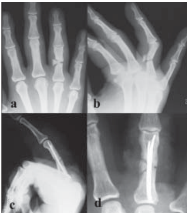
Figure 3: (a) AP view (b) lateral view of left hand shows unstable segmental proximal phalangeal fracture. Postoperative AP and lateral X-ray (c and d) of left hand of same patient shows segmental fracture fixed with multiple nails