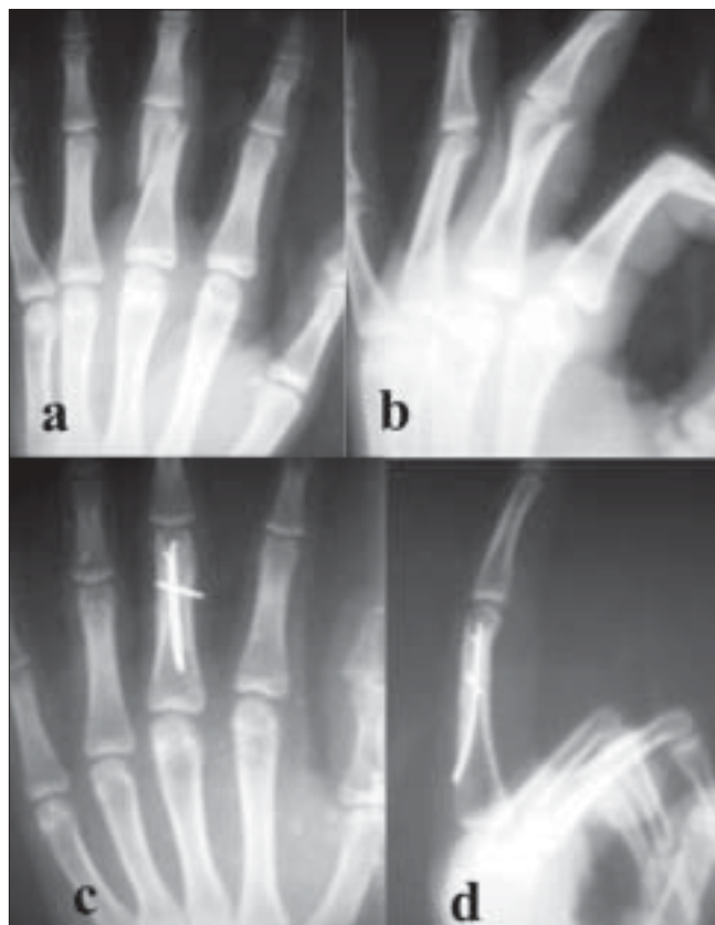
Figure 2: (a) Antero-posterior (AP) and (b) lateral view of right hand shows unstable long oblique fracture. AP and lateral X-ray (c and d) of right hand of the same patient shows additional interfracture K-wire for additional stability in long oblique fracture

under supervision. As all the fracture patterns operated were stable enough postoperatively, the rehabilitation program was the same for all fracture patterns. However, those fractures which were open reduced were observed closely for tendon adherence and scarring and merited vigorous physiotherapy to avoid the same. All the patients were followed up for a minimum of six months. All the patients were assessed