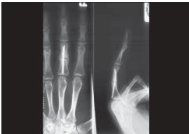
Figure 4: Anteroposterior and lateral X-ray views show radiological evidence of union in six weeks

cross K-wires have reported to create distraction of fracture fragments causing delayed union and nonunion. 24